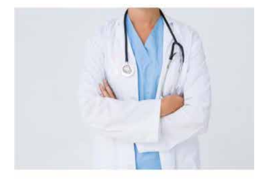
A Primary Care Physician Or A Vein Treatment Specialist—Who Should You Consult?

We rely on our primary care doctors for our immediate [...]